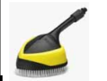
Delta Racer 150